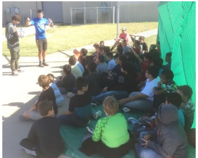
Elementary students listen closely as staff and volunteers teach at a Backyard Bible Club about being set “Free Indeed” by Jesus.